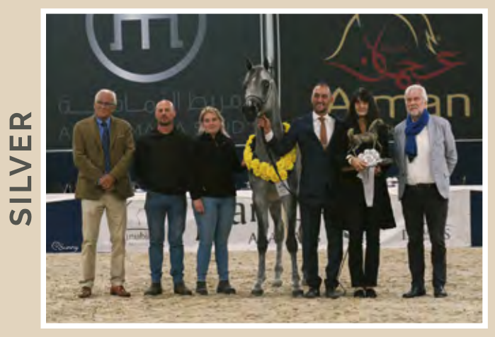
PYRAMID NASEEB EL KAHILEH NASEEM AL RASHEDIAH X PYRAMID KAHILEH BREEDER: PYRAMID STUD OWNER: PYRAMID STUD

WADEE AL SHAQAB X ILENA EL ARYES BREEDER: BOUCHE ARABIANS OWNER: BOUCHE ARABIANS