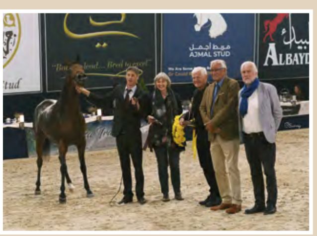
PRINCESS MARGA LAMANDRO X PRINCESS MARENGA BREEDER: SAX ARABIANS OWNER: SAX ARABIANS