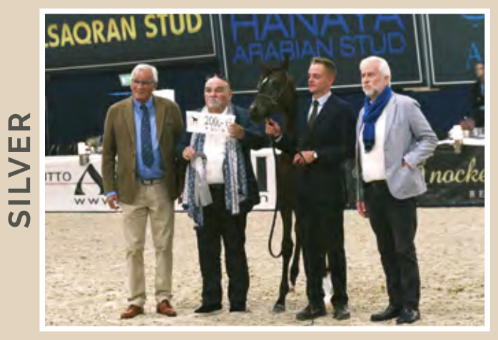
CBA MILLIAS CBA ILLIAS X MAHARANI CF BREEDER: BOUCHE ARABIANS OWNER: BOUCHE ARABIANS

HL EL GANADOR X AJ TIRAN BREEDER: HANAYA ARABIANS OWNER: HANAYA ARABIANS