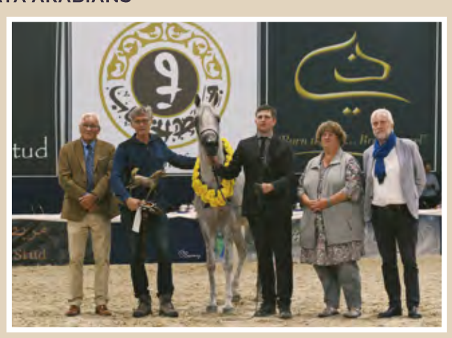
NDA SAIDA JAMIL DF MALIK JAMIL X NDA SABAH EL DAHMA BREEDER: NILE DAWN ARABIANS OWNER: NILE DAWN ARABIANS