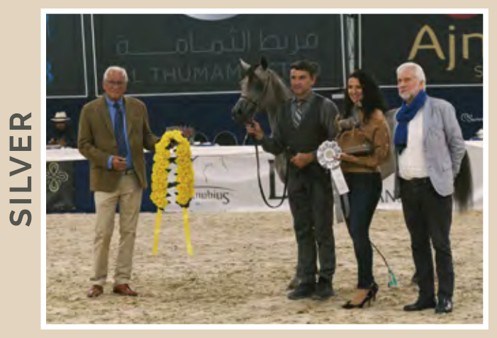
MARAYA SAMJAD AJ ELAF X ATOUCH OF MAGIC ORA BREEDER: SAMJAD STUD LIMITED OWNER: SAMJAD STUD LIMITED

WADEE AL SHAQAB X ILENA EL ARYES BREEDER: BOUCHE ARABIANS OWNER: BOUCHE ARABIANS