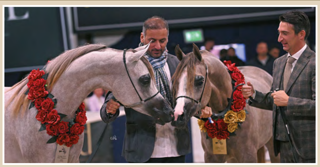
D NAJLAH (GOLD YEARLING FILLY) AND D RASSEL (SILVER YEARLING FILLY)

Horse Stud. A second place was for Psyches Aspara (Gaith al Zobair x Psyche Victoria) – bred and owned by Chrcynno Palac from Poland.